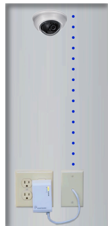
--- Ethernet Cable (Behind the Wall)