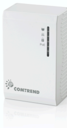
PG-9172PoE 100Mbps G.hn Powerline Adapter with PoE Used for the connection to the Camera