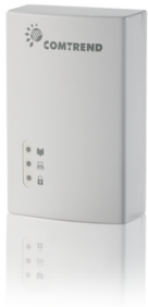
PG-9172 1200Mbps G.hn Powerline Adapter Used as backhaul